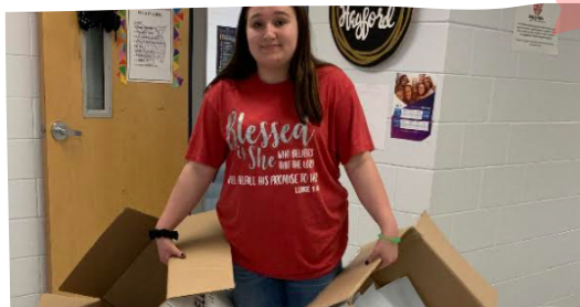
Bethelham High School Chapter