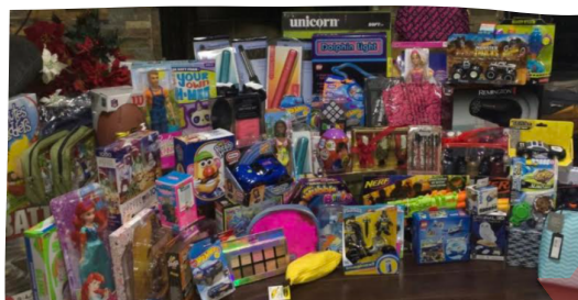
Wellington High School Chapter