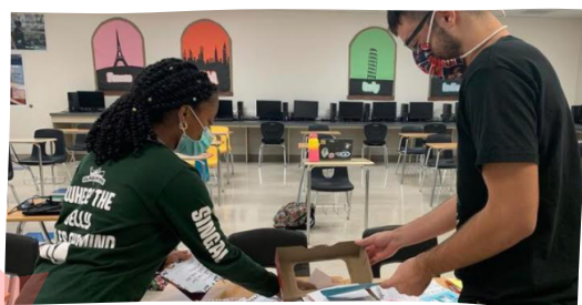
Hialeah Gardens Chapter