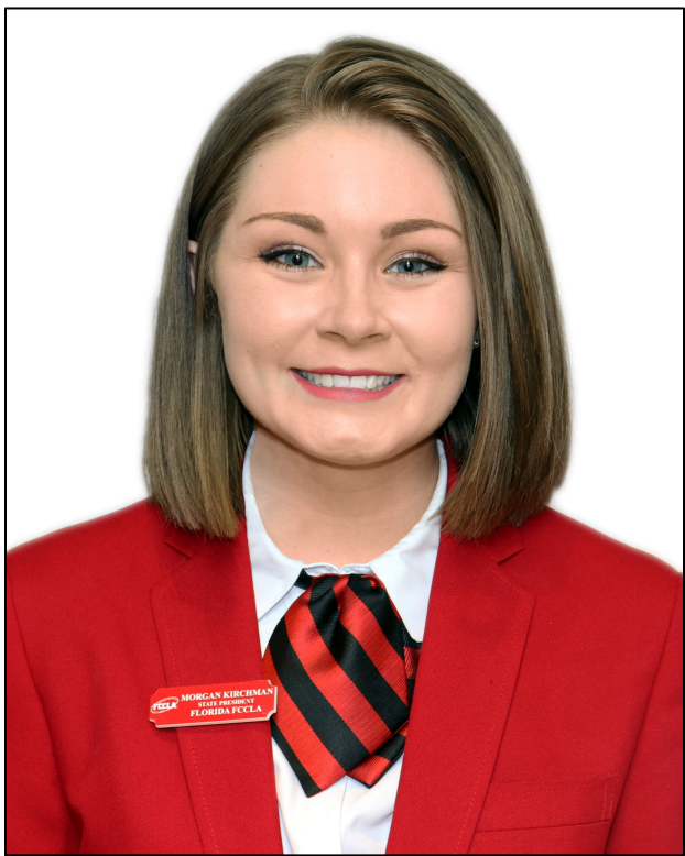
State President Birthday: 12/26/01