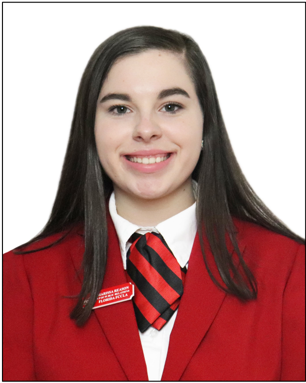
VP of Public Relations Birthday: 03/14/03

My favorite FCCLA moment has been the installation process. Becoming a state officer has been one of the most outstanding and honorable things I've done in my life and as a state officer I will continue to build on myself, become a better person, and a better leader.