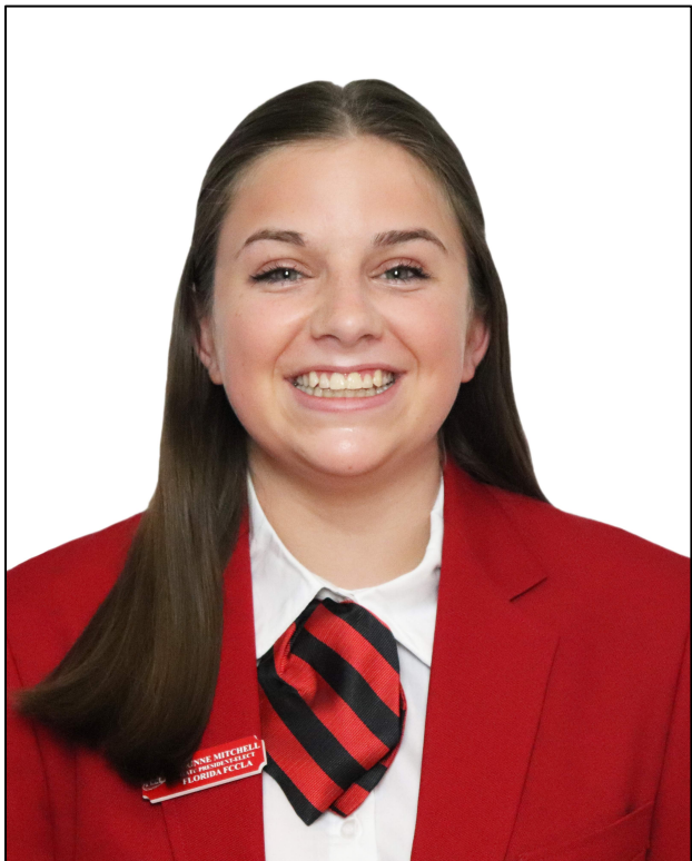
President – Elect Birthday: 09/02/03

My favorite FCCLA moment would have to be the first general session of NLC in San Diego. It was so surreal to realize that there were thousands of students from across the country all united for one common goal, to grow their leadership skills. Experiences like that have fueled me to continue my FCCLA journey and help others reach their goals similar to mine.