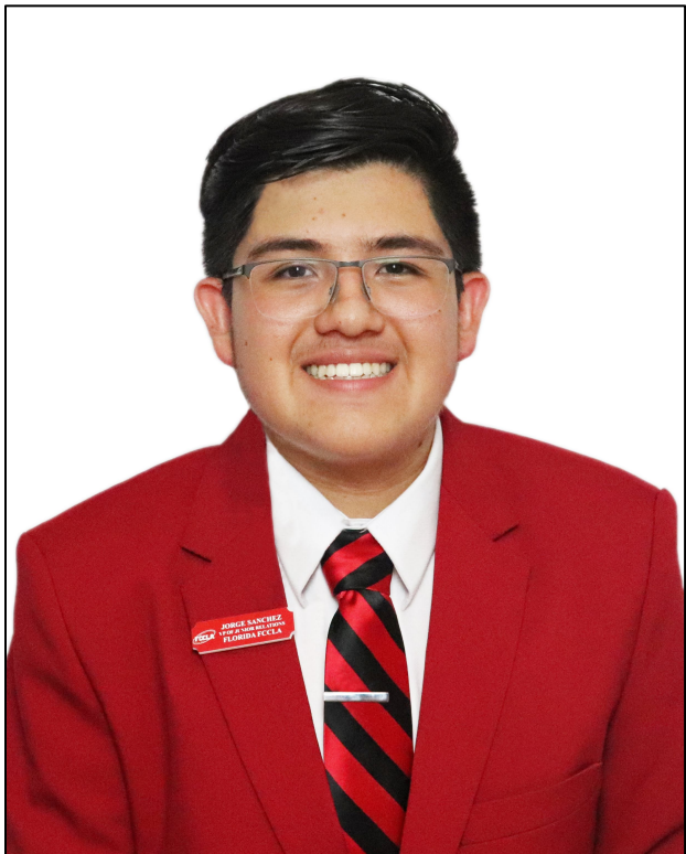
VP of Junior Relations Birthday: 01/17/05

To be quite honest, all of them. From the day I joined, to the day I was elected as the State VP of Junior Relations, to the day I sat in between 8,600 people at Nationals, all of the memories along the way have been my favorite. FCCLA impacted my life, and it hasn't failed to stop doing just that. Everything I experience in this great organization has led to me becoming the person I am today, which is why I am grateful for everything that has come along the way.