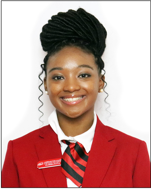
VP of Community Service Birthday: 01/22/02

To execute the Community Service project all year long.