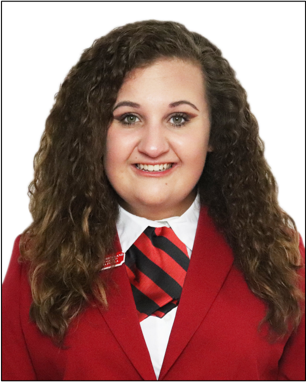
VP of Management Birthday: 12/04/01