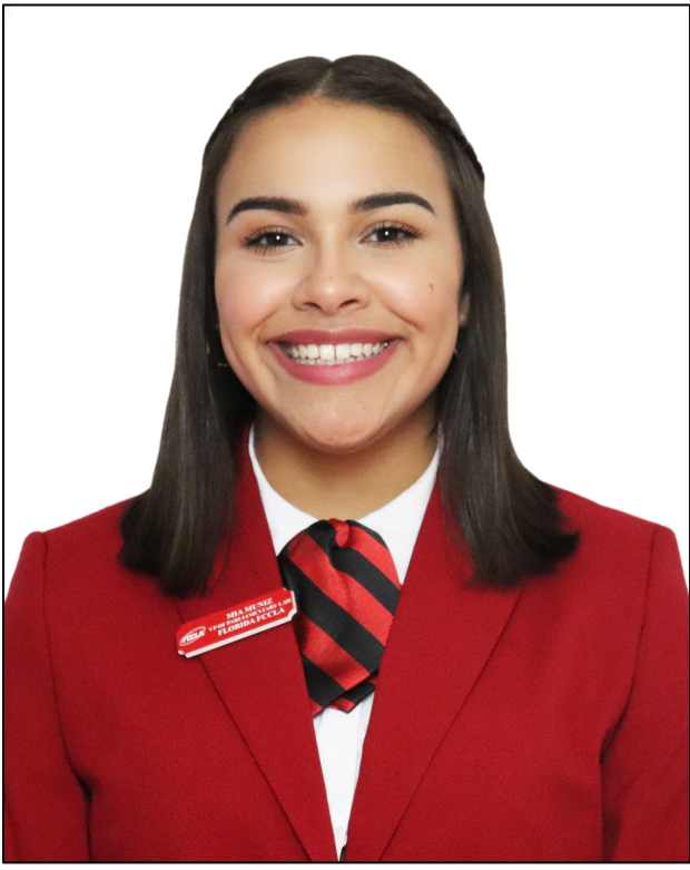
VP of Parliamentary Law Birthday: 03/05/04

My favorite FCCLA moment was when I was running for a state officer and stood on the stage in front of all my peers!