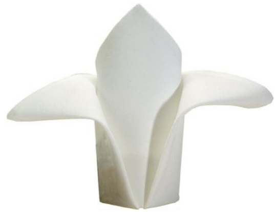
Three Cornered Cap